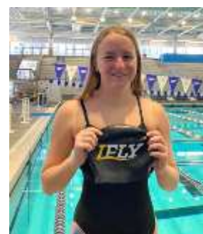
Clockwise from top: State Champ Milky Way Masters, state trophy, I-Fly competitor, Prairie Meadows pool and Quad Cities Masters swimmers.